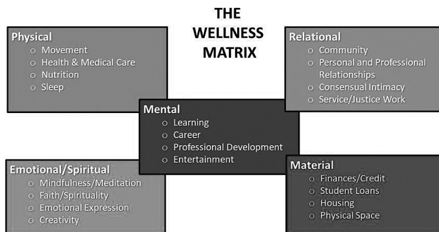
Exhibit 2 – The Wellness Matrix

well-being, and (5) material well-being. Each Matrix block contains elements that relate to that particular dimension of wellness, though the lists are not exhaustive. The physical block includes movement, health, nutrition, and sleep as considerations. The relational block holds personal relationships, ties to community, and service to local, national, and global communities, such as work for racial justice. The mental block encompasses learning, career, professional development, and entertainment. The emotional/spiritual block includes mindfulness practices, faith/spirituality, emotional expression, and creativity. The material block contains finances/credit, student loans, housing, and physical space. The Wellness Matrix provides a visual illustration of the specific areas to consider as we think about wellness.