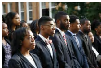
Friday, August 18, 2017 HUSL Pinning Ceremony Class of 2020