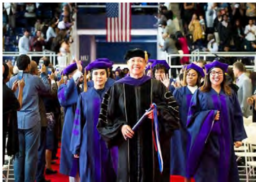
HUSL 2017 Hooding Ceremony

skilled trial attorney, television legal analyst/contributor, crisis manager, radio host, noted speaker, adjunct law professor, certified leadership trainer and ordained minister. Her words of inspiration were very encouraging to the HUSL Class of 2017.