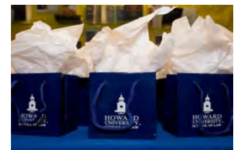
Friday, October 20, 2017 The 3rd Annual HUSL Homecoming alumni Reception.

For more information on upcoming events, please visit our website at www.law.howard.edu