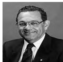
Friday, October 13, 2017 The 14th Annual Wiley Branton/Howard Law Journal Symposium.