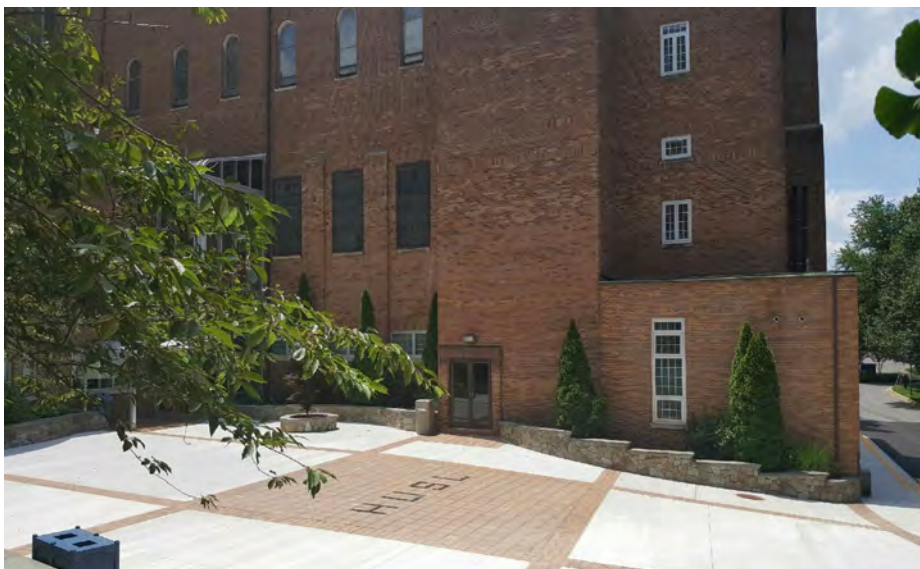
Newly Renovated Entrance to Charles Hamilton Houston Hall—HUSL

“Where you see wrong or inequality or injustice, speak out, because this is your country. This is your democracy. Make it. Protect it. Pass it on”.