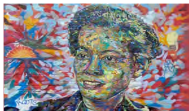
Friday, September 15, 2017 HUSL will host “Singing of A New American.” Pauli Murray’s Legacy and Jus- tice in the 21st Century.